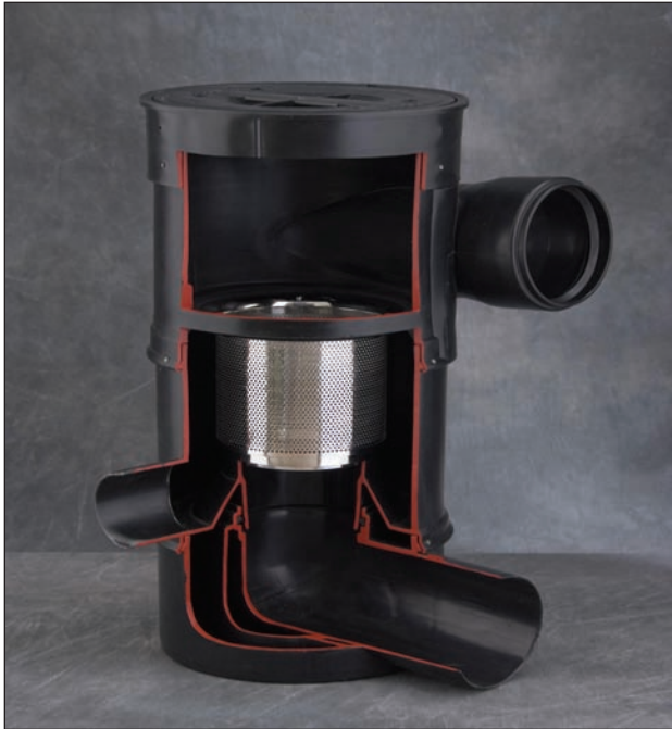
Photo A. Vortex filter cut-away.

and often replace the first flush diverter, as well. These devices incorporate a fine filter in a housing that provides an unpressurized circular flow of water. This allows debris to fall out of suspension and be washed down an auxiliary drain while 90% of the clean water makes it to the collection point. If debris screens are used, they should be configured with maintenance in mind. Regardless of what system is used, care should be taken to ensure that the system does not trap water on the roof.