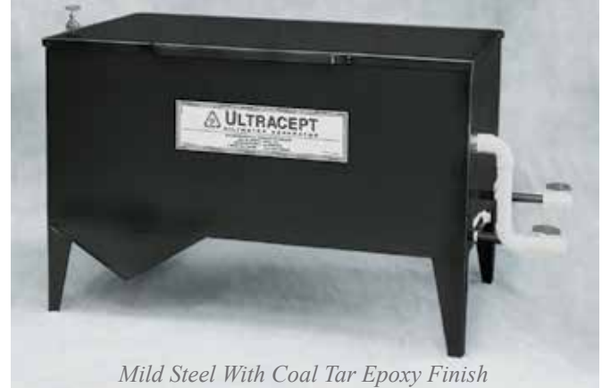
Mild Steel With Coal Tar Epoxy Finish