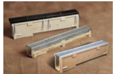
Fig. #9816, 9818, and 9814