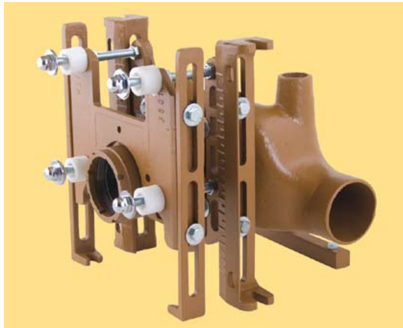
> Figure 2. Front view of a bariatric-duty (1,000 lbs.) water closet support.

In the past, we have seemed to overlook the fact that the morbidly obese patient accesses commercial buildings and healthcare facilities just like anyone else. As it relates just to the healthcare industry, obese patients, like all other patient types, become part of the healthcare delivery continuum through inpatient, ambulatory, and outpatient settings. Their physical needs and conditions, however, are highly specialized.