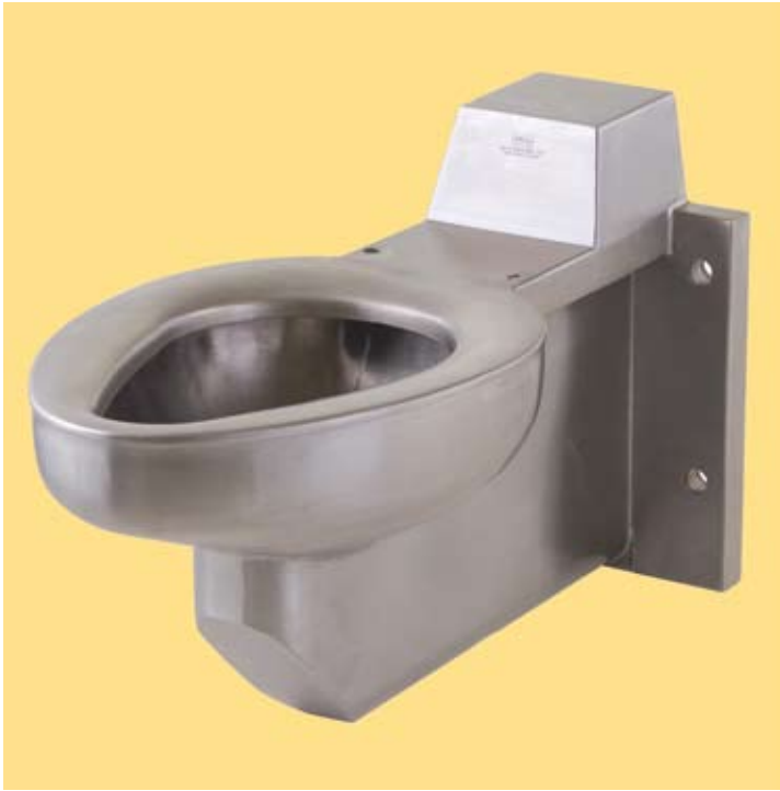
> Figure 3. Front view of an elongated bariatric-duty wall-mounted toilet bowl – rated up to 1,000 pounds.