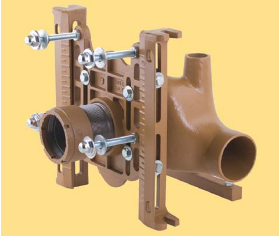
> Figure 1. Front view of an extra-heavy-duty (750 pounds) bariatric water closet support.