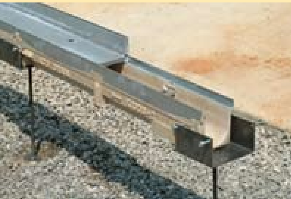
Fig. # 9869-D Double Arrow Channel Support