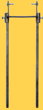
Fig. # 9869-R Rebar Channel Support Chair