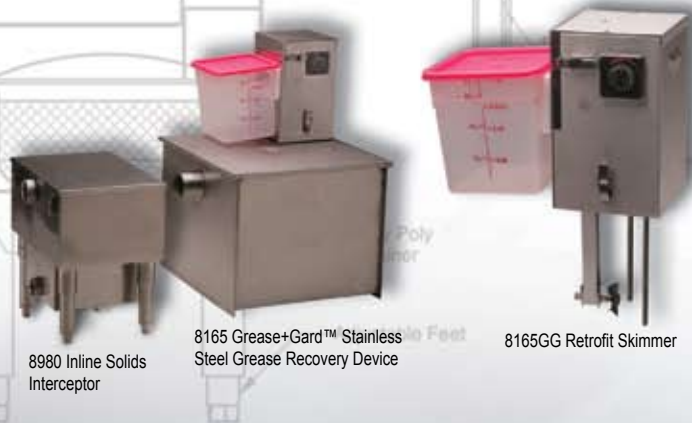
8980 Inline Solids Interceptor

Grease+Gard™ is an automatic grease recovery device that relies on a belt and heater assembly to pick up the grease. The Grease+Gard™ Skimmer can be retrofitted on any grease interceptor, metal or plastic, or can be purchased as a system complete with a grease and solids interceptor.